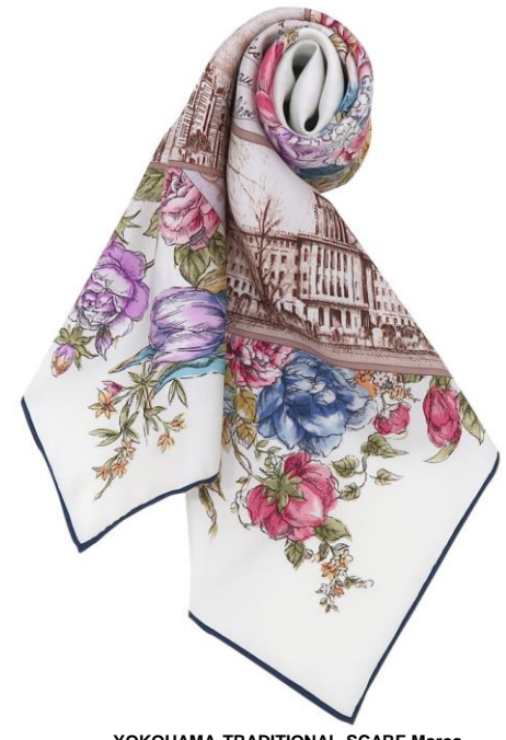
YOKOHAMA TRADITIONAL SCARF Marca