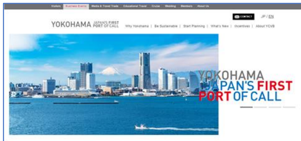
YCVB Convention website top page

* technical-visit: An inspection trip to learn about advanced technologies. (Source: JTB Research Institute Tourism Glossary)