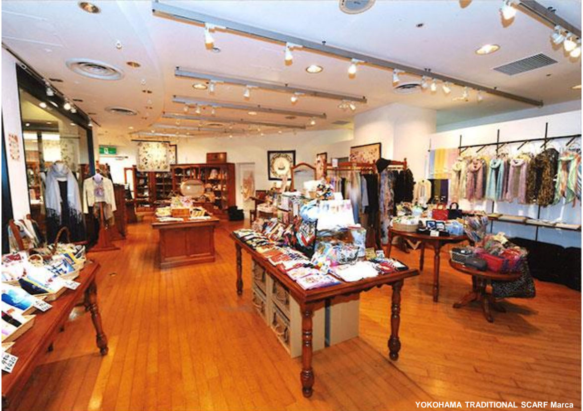
YOKOHAMA TRADITIONAL SCARF Marca