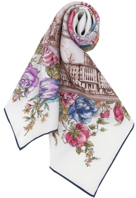
YOKOHAMA TRADITIONAL SCARF Marca