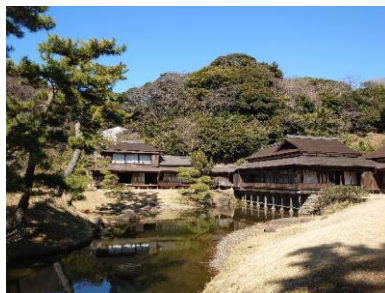
Sankeien Garden, Yokohama's most beautiful Japanese garden