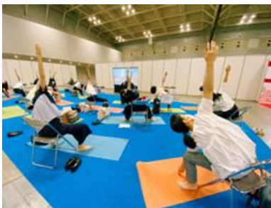
Yokohama Mobile Yoga at PACIFICO Yokohama Exhibition Hall